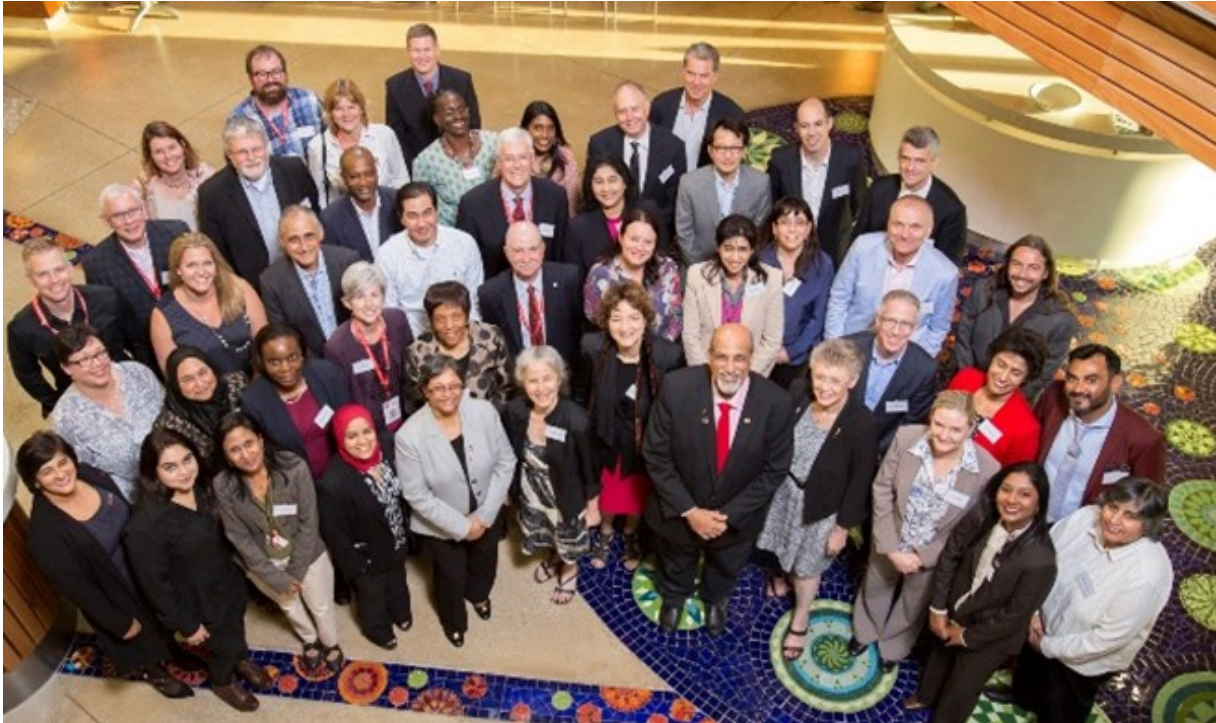
CAPRISA Scientific Advisory Board members, CAPRISA staff and several world-renowned scientists at the CAPRISA SAB Meeting held in July 2016

On 24 th November 2016 the CAPRISA Board of Control approved the report of the CAPRISA Scientific Advisory Board (SAB) annual meeting held on 20 July 2016. The SAB meeting was timed to coincide with the International AIDS Conference in Durban. A number of leading scientific experts who were attending the conference were invited to attend the SAB and provide comments. The SAB undertakes a detailed review of CAPRISA's research programme every 3 years, with the last such review having been conducted in April 2015.